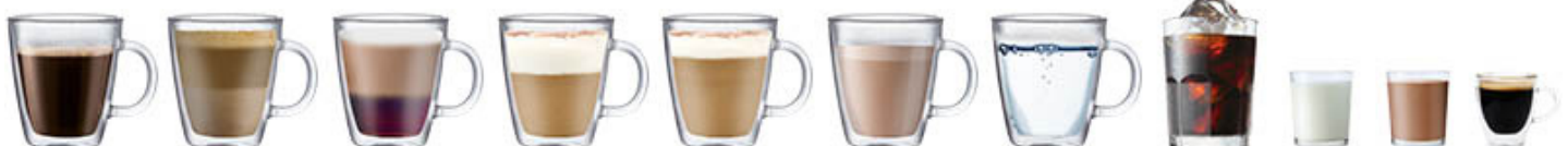
Coffee Cafe Mocha Mochaccino Latte Cappuccino Hot Coco Hot Water Iced Coffee Milk Shots Espresso

The engaging and intuitive touch screen allows consumers to easily choose a beverage and customize the size and strength of each drink. Allows up to 3 drink sizes (6oz to 20oz) and strengths (mild, regular and bold) to be visible on the screen to the consumer. Bistro Touch also allows drink sizes and strengths to be disabled in programming for locations that want to serve only one cup size or a specific strength.